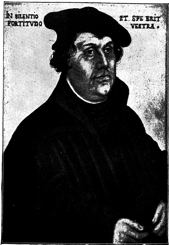
LUTHER IN 1532